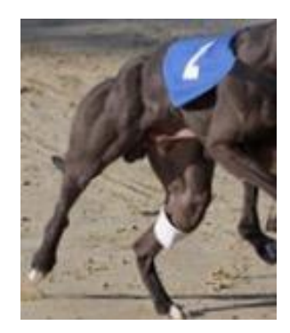
The left hind leg may be taped to prevent tibial periostitis (track leg) due to the impact of the tibia against the elbow